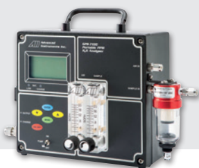
Reliable spot checks