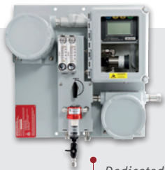
Dedicated sample handling systems