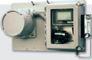
Cost effective and simple to use