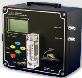
Suitable for hazardous area use