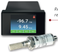
Reliability and repeatability