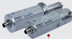
Plug & Play solution