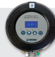
SIL2 Capable & hazardous areas