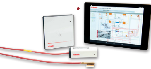
Continuous monitoring system