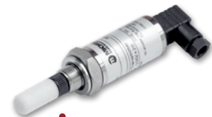
One sensor covers all applications