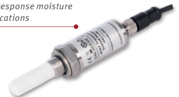
Cost effective, rugged sensor