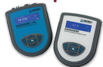
Hazardous area or general purpose