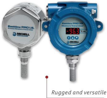
Rugged and versatile