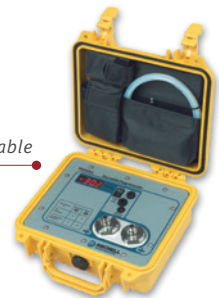
Rugged self-contained portable