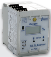
Fail-safe O 2 analyzer